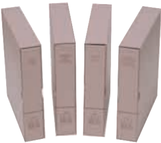
Linen Binders (all titles available)