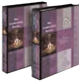
Vinyl Binders (some titles available)