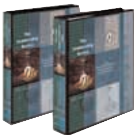
Vinyl Binders (some titles available)