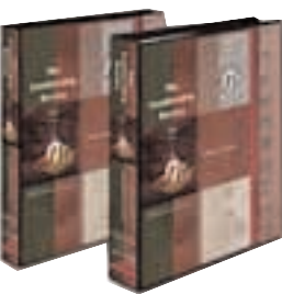
Vinyl Binders (some titles available)

Character courses are designed to encourage mental, spiritual, and practical wisdom development in the life of the participant. Courses and issues are constructed to emphasize personal reflection, discipline, orientation, holiness, use of time, perseverance, and other key character traits.