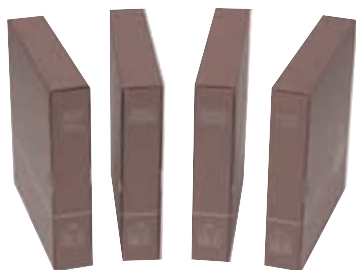
Linen Binders (all titles available)

Academic courses are designed to found the participant in the academic skills and orientations necessary for effective ministry. Academic courses include the comprehensive study of the Scriptures and the formation of a comprehensive belief framework in culture.